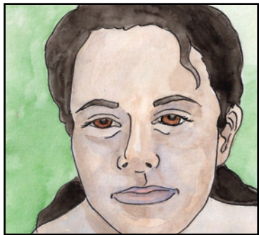
Lips or skin turning blue