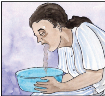
Severe vomiting or diarrhea